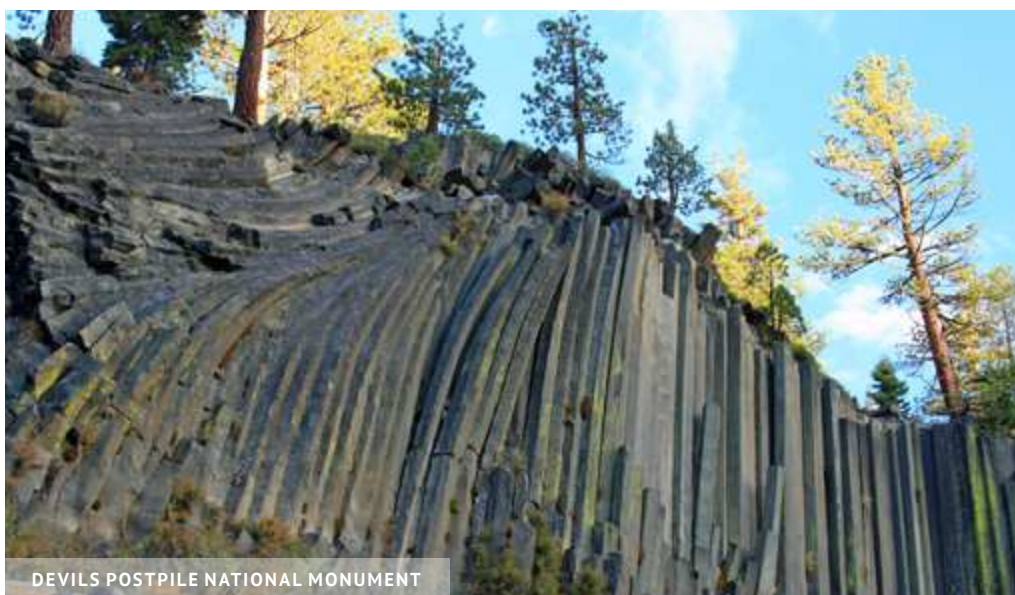
DEVILS POSTPILE NATIONAL MONUMENT

* Note: vehicles over 25 feet in length are not allowed on Devils Postpile Spur Road .