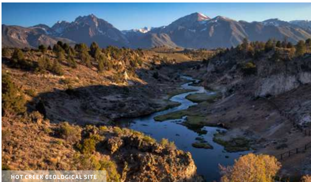
HOT CREEK GEOLOGICAL SITE