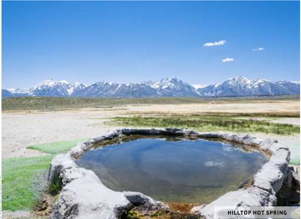
HILLTOP HOT SPRING

The Convict Lake Loop Trail is just under 4 kilometres (2 hours), but is easier than Crystal Lake Trail. It is popular with families and fishermen and is accessible between June and November. The trail hugs the shore all the way around Convict Lake, meandering through open sagebrush country and groves of pine and aspen, with the sheer granite scarps of Mt. Morrison and Laurel Mountain rising above. It can be accessed by the Convict Creek Trailhead parking lot or the Convict Lake Picnic Area. WWW.MAMMOTHTRAILS.ORG/TRAIL/57/CONVICT-LAKE-LOOP