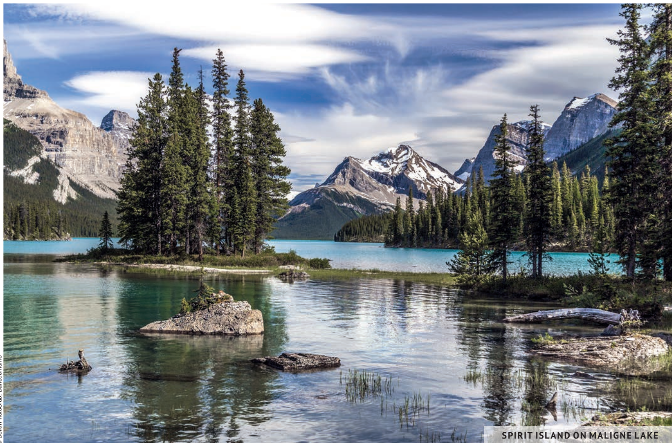
SPIRIT ISLAND ON MALIGNE LAKE