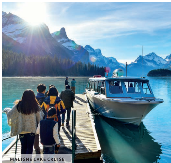
MALIGNE LAKE CRUISE

616, PATRICIA STREET (BILLETTERIE DE JASPER) / 780-852-3370 WWW.BANFFJASPERCOLLECTION.COM/ATTRACTIONS/MALIGNE-LAKE-CRUISE