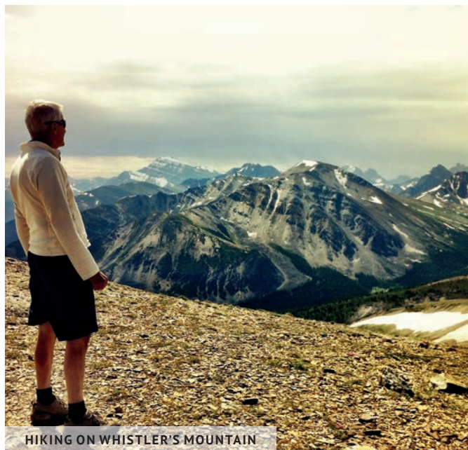
HIKING ON WHISTLER'S MOUNTAIN