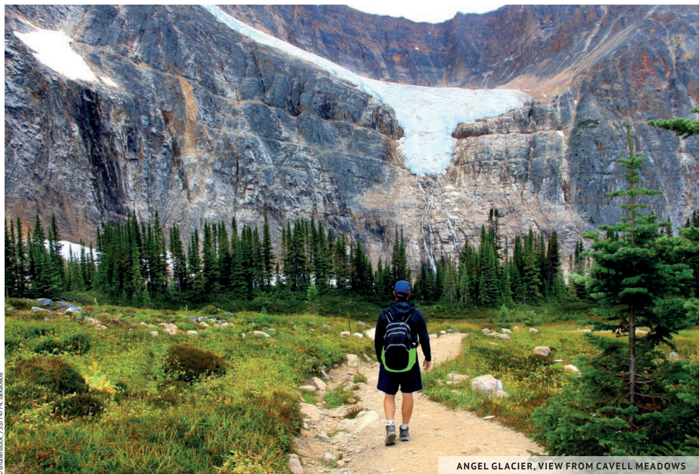
ANGEL GLACIER, VIEW FROM CAVELL MEADOWS