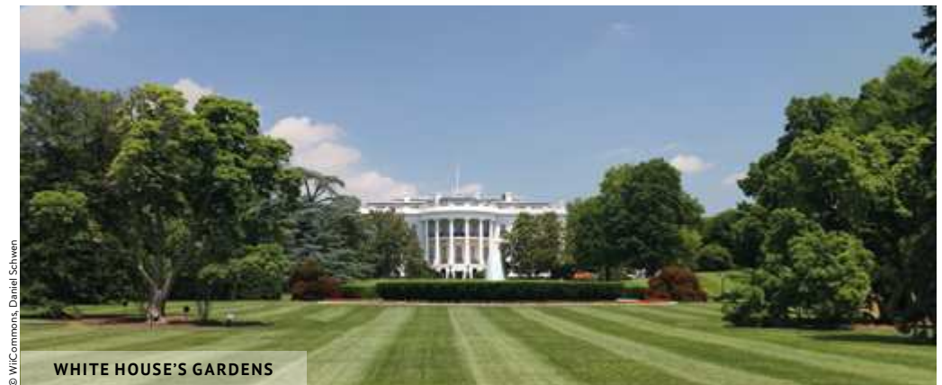
WHITE HOUSE'S GARDENS