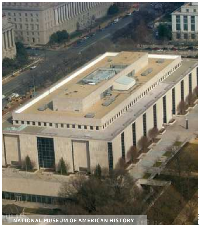
NATIONAL MUSEUM OF AMERICAN HISTORY