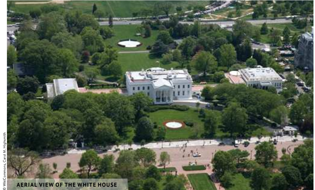
AERIAL VIEW OF THE WHITE HOUSE

1600 PENNSYLVANIA AVENUE NW, WASHINGTON DC 202-456-1111 WWW.WHITEHOUSE.GOV