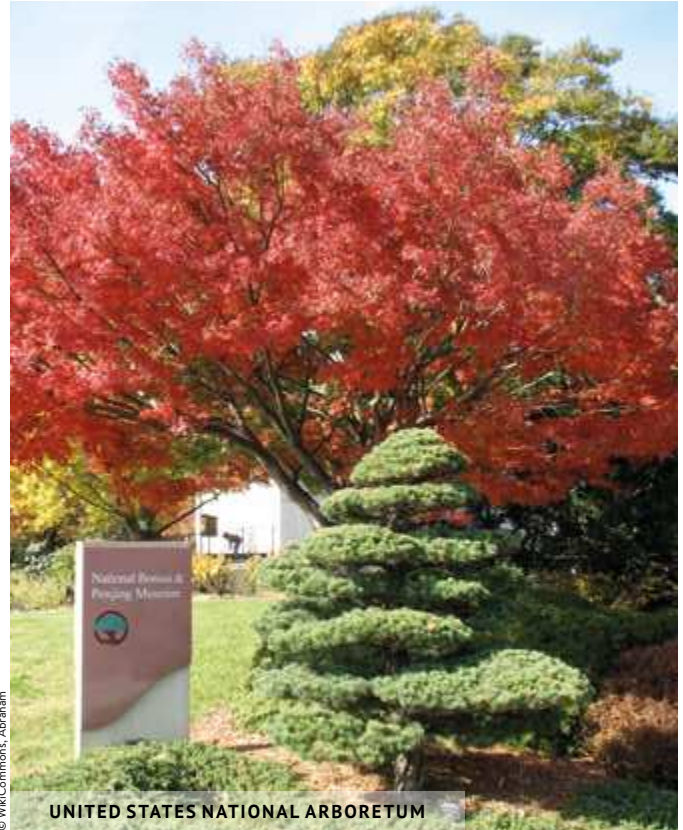
UNITED STATES NATIONAL ARBORETUM

3101 WISCONSIN AVENUE NW, WASHINGTON DC 202-537-6200 WWW.CATHEDRAL.ORG