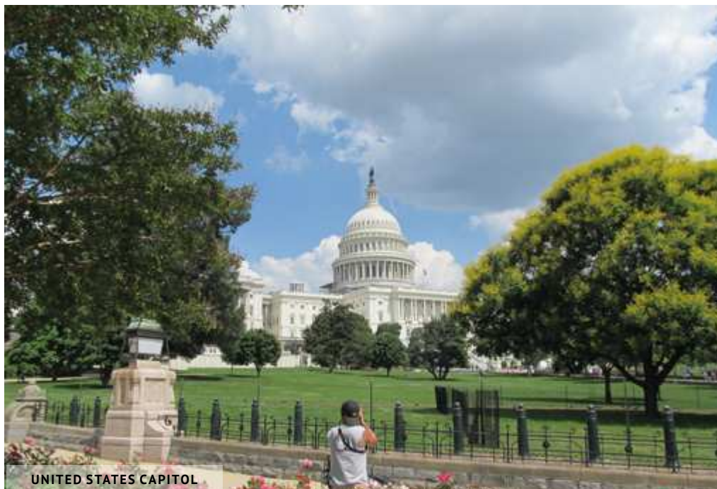
UNITED STATES CAPITOL

This botanic garden, located on the grounds of the U.S. Capitol, is made up of the Conservatory (a vast greenhouse), the National Garden (featuring a rose garden) and Bartholdi Park with its majestic fountain. A second-storey catwalk looks down over the jungle canopy. Usually open daily from 10 a.m. to 5 p.m. Admission is free!