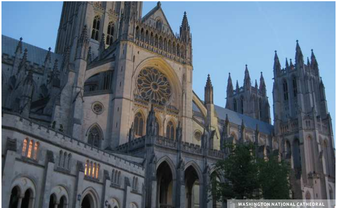
WASHINGTON NATIONAL CATHEDRAL