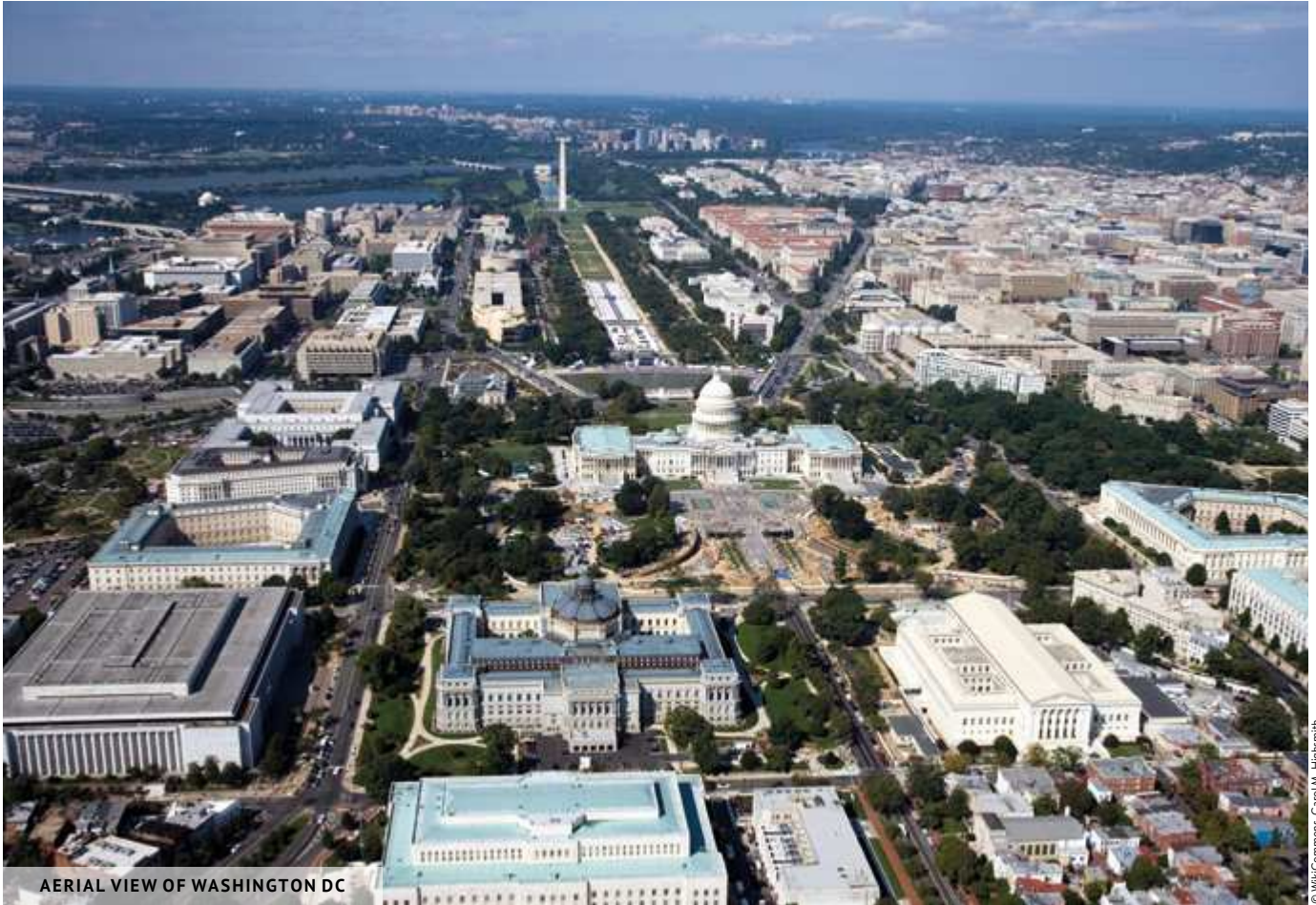
AERIAL VIEW OF WASHINGTON DC