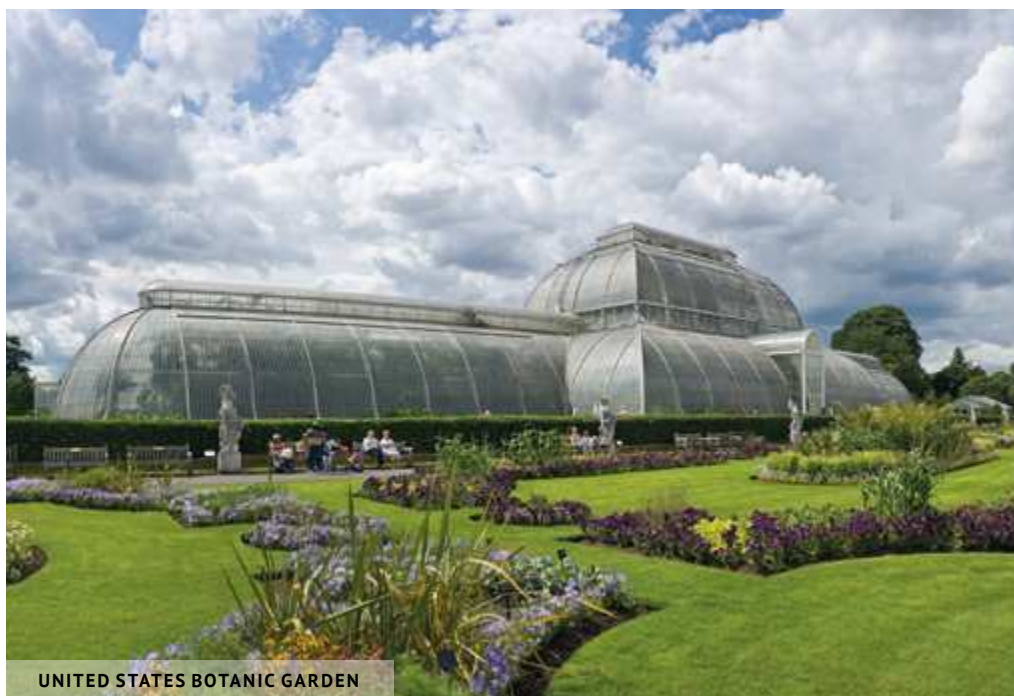
UNITED STATES BOTANIC GARDEN