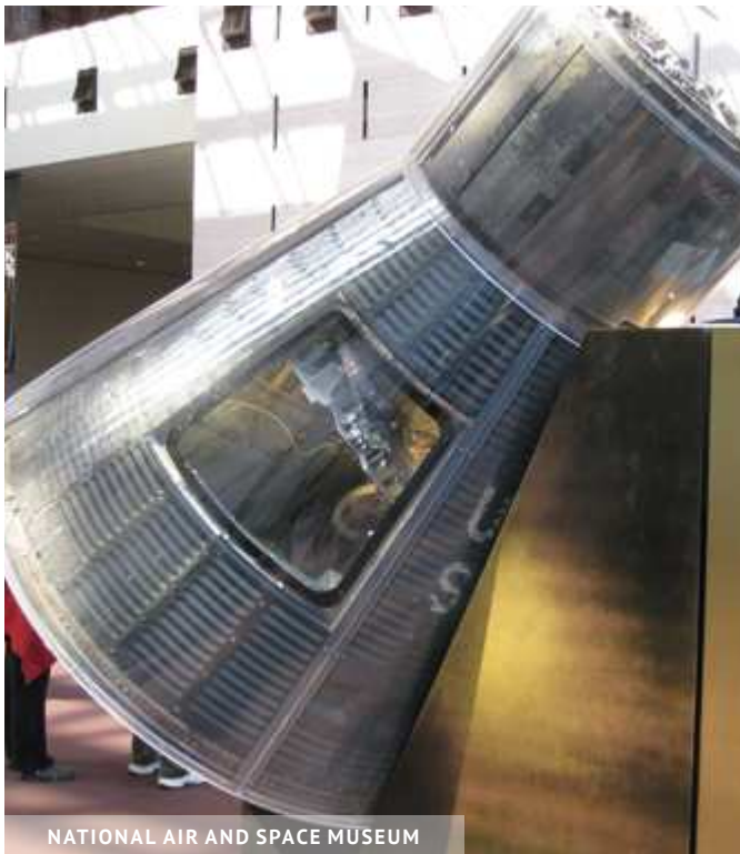
NATIONAL AIR AND SPACE MUSEUM