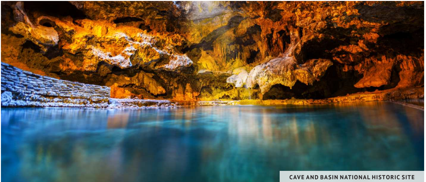
CAVE AND BASIN NATIONAL HISTORIC SITE

BANFF GONDOLA – 1, MOUNTAIN AVENUE, BANFF 403-762-2523 / WWW. BANFFJASPERCOLLECTION.COM/ ATTRACTIONS/BANFF-GONDOLA