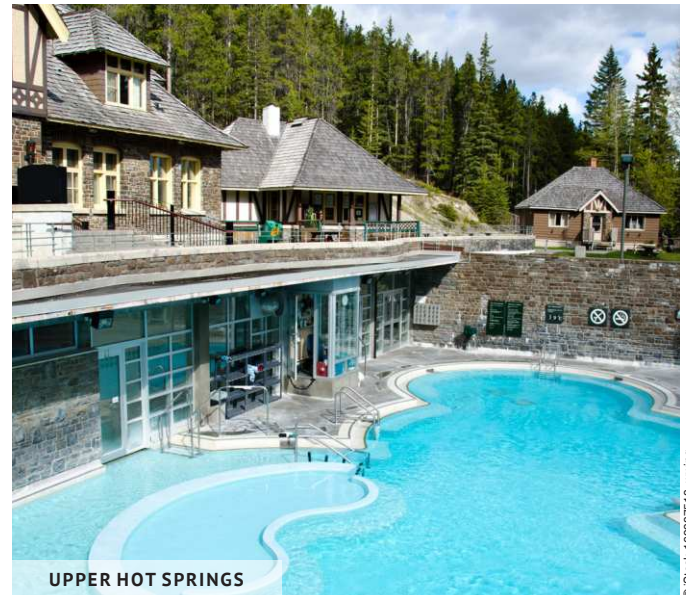
UPPER HOT SPRINGS