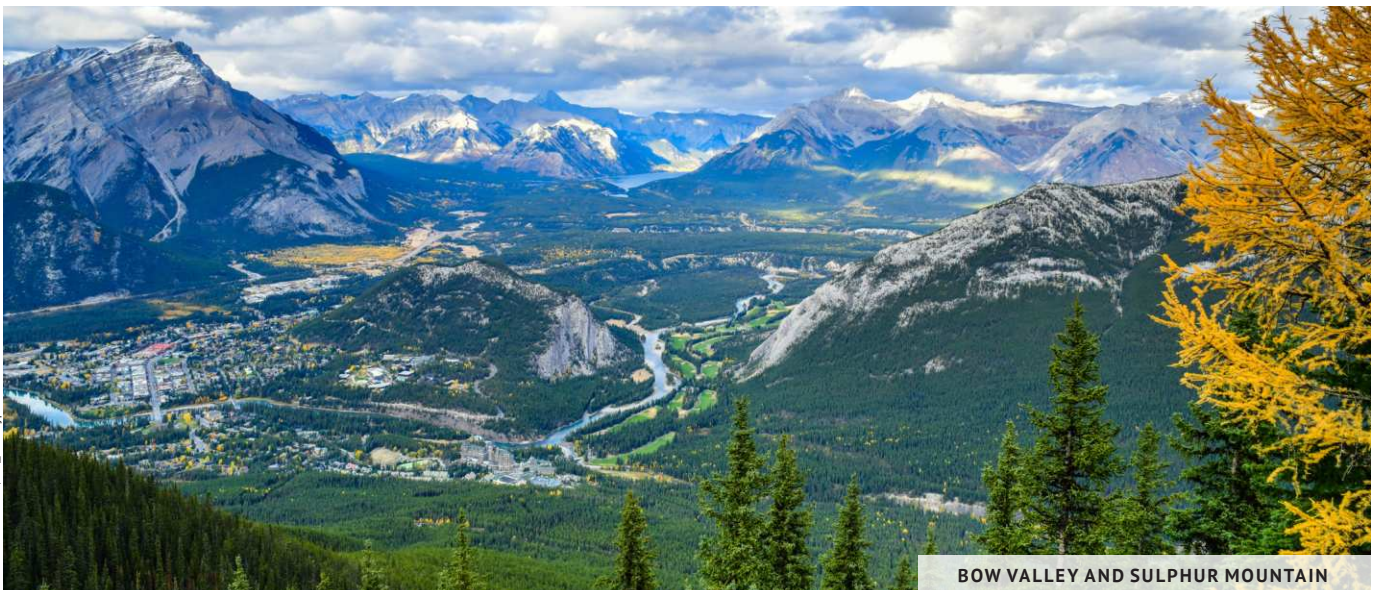
BOW VALLEY AND SULPHUR MOUNTAIN