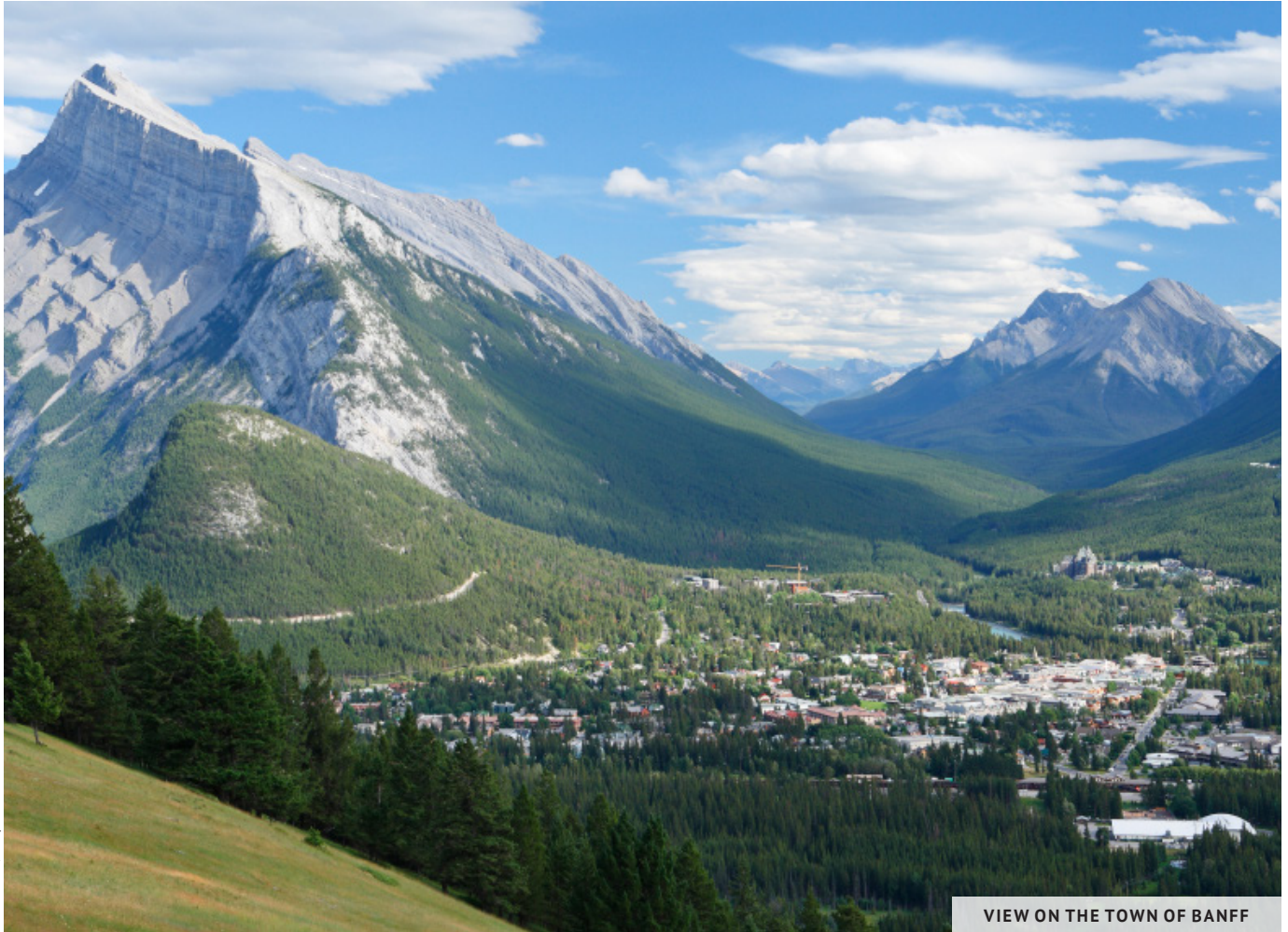
VIEW ON THE TOWN OF BANFF