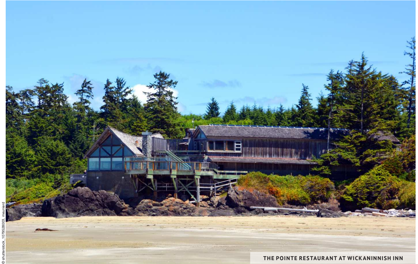
THE POINTE RESTAURANT AT WICKANINNISH INN