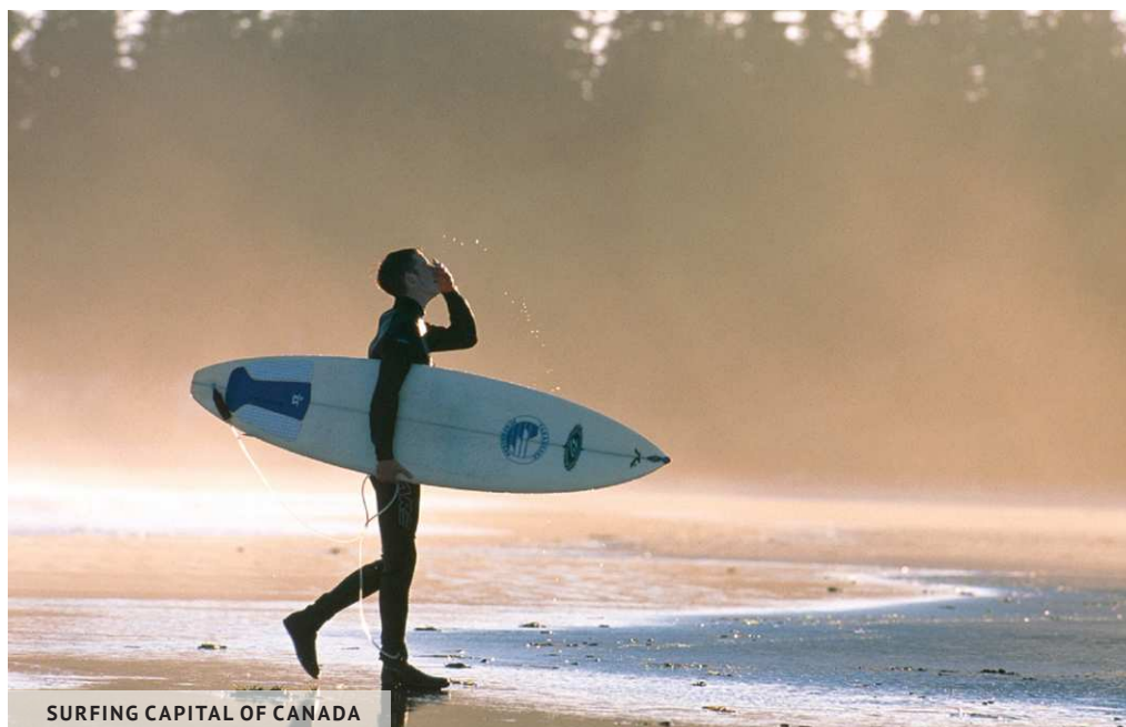
SURFING CAPITAL OF CANADA

In late June, at the end of the road in Tofino, you will find a small but charming jazz festival with an interesting program. (380, Campbell Street, Tofino) www.tofinojazzfestival.com