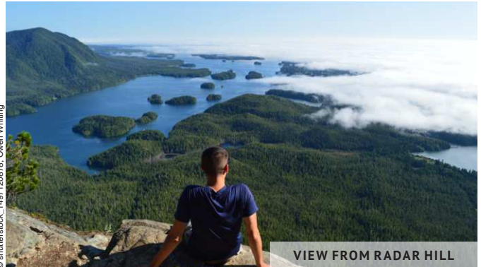
VIEW FROM RADAR HILL