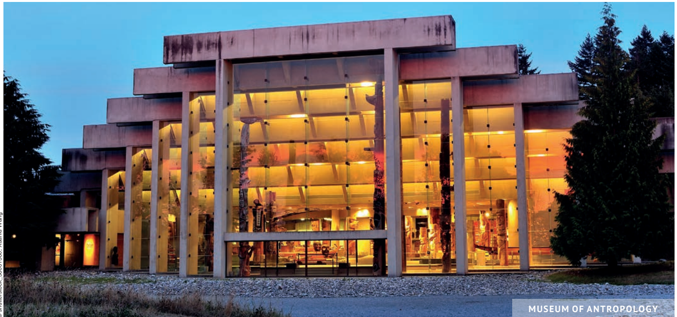
MUSEUM OF ANTHROPOLOGY

performers and fish & chips vendors! The island boasts many restaurants, bars, theatres, artists' studios and craft boutiques. With its wide range of local produce and products, the Granville Island Public Market is the perfect place to prepare your picnic lunch! The market is open daily from 9 a.m. to 6 p.m. WWW.GRANVILLEISLAND.COM