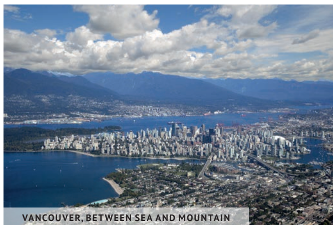
VANCOUVER, BETWEEN SEA AND MOUNTAIN