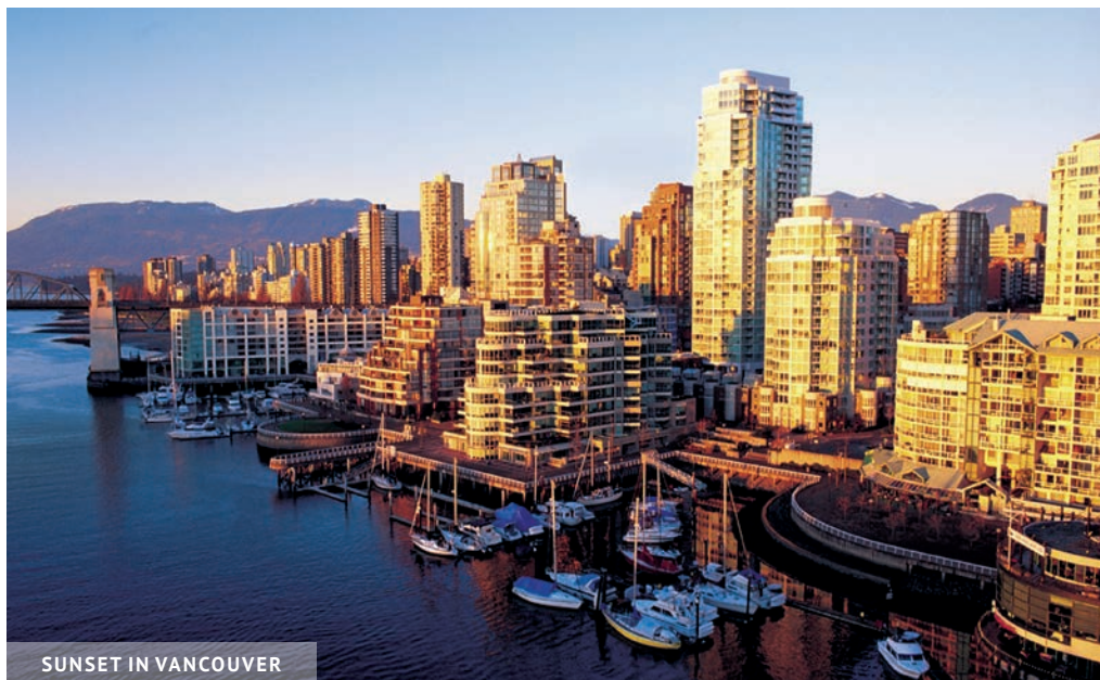
SUNSET IN VANCOUVER

In the mood for some shopping ? Robson Street , in the West End , and Broadway Avenue , in Kitsilano , are two shopping destinations that are popular with locals and tourists alike, offering fashion and more for everyone and every budget. In fact, two well-known Canadian brands originated in these areas of Vancouver a number of years ago: Mountain Equipment Co-op (MEC) , Canada's largest supplier of outdoor equipment, and Aritzia , an innovative women's fashion boutique.