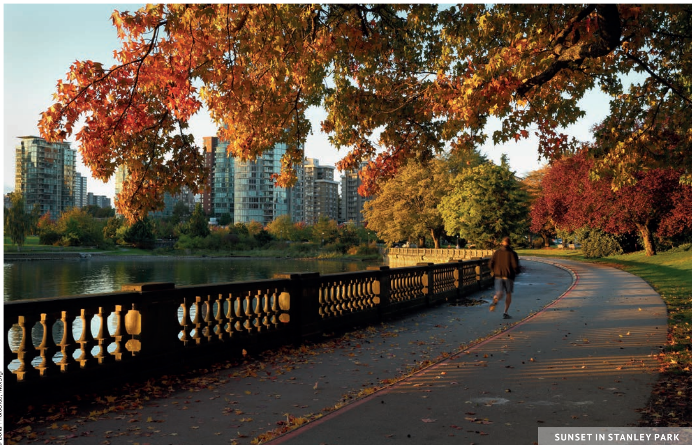
SUNSET IN STANLEY PARK