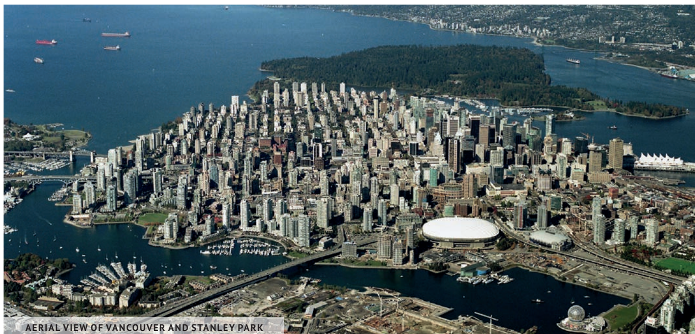
AERIAL VIEW OF VANCOUVER AND STANLEY PARK