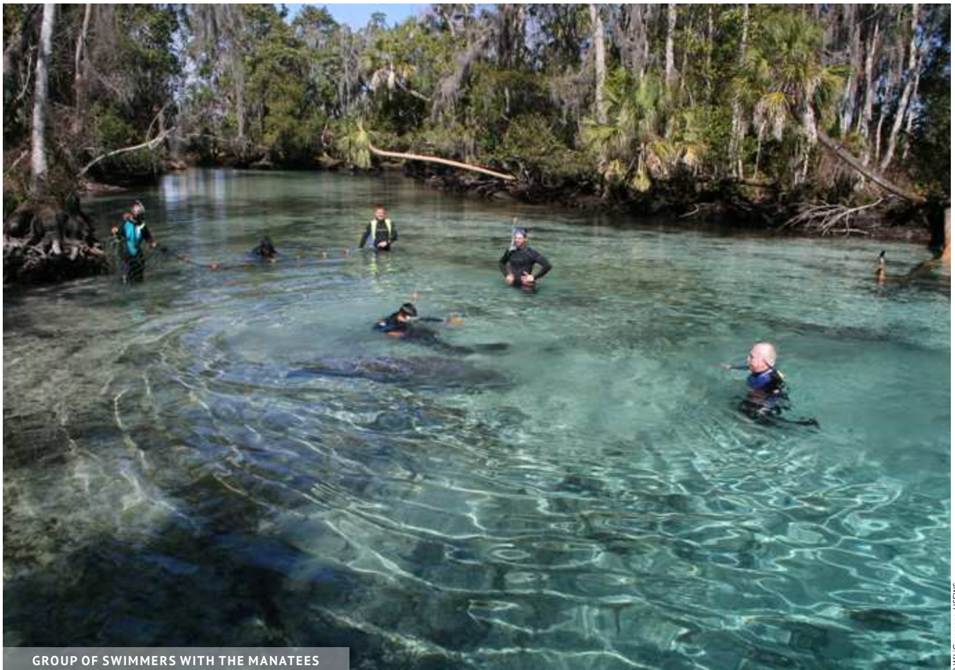
GROUP OF SWIMMERS WITH THE MANATEES