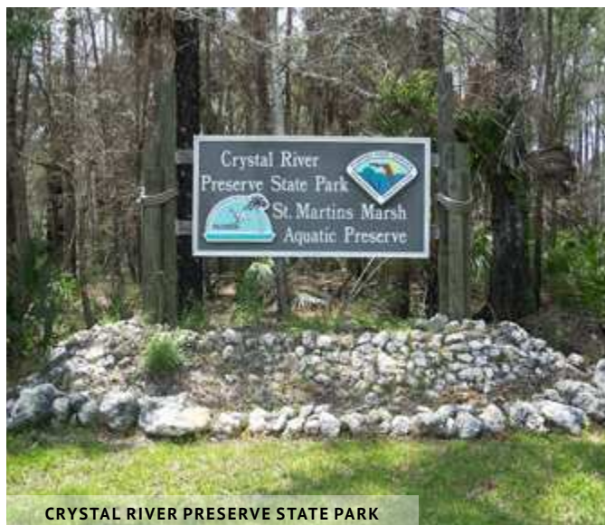
CRYSTAL RIVER PRESERVE STATE PARK