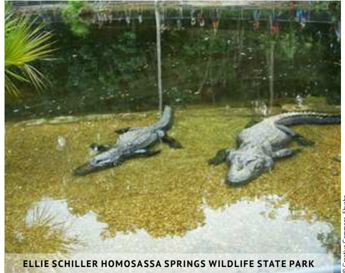
ELLIE SCHILLER HOMOSASSA SPRINGS WILDLIFE STATE PARK

4150, S. SUNCOAST BOULEVARD (US 19), HOMOSASSA 352-628-5343 WWW.FLORIDASTATEPARKS.ORG/ PARK/HOMOSASSA-SPRINGS