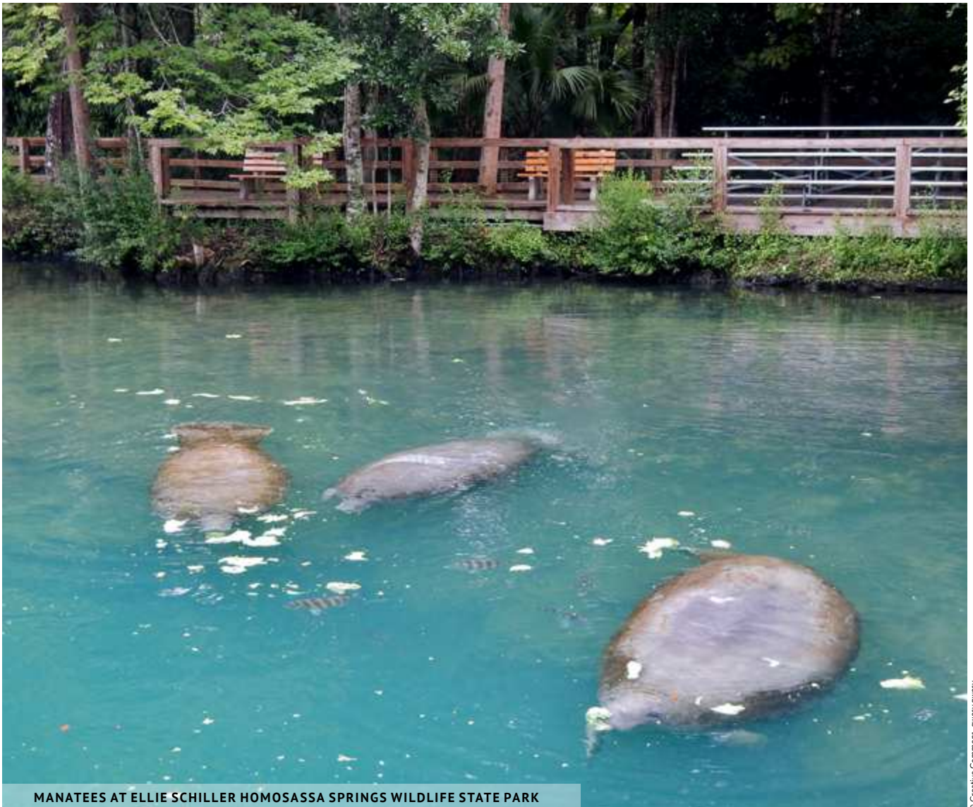
MANATEES AT ELLIE SCHILLER HOMOSASSA SPRINGS WILDLIFE STATE PARK