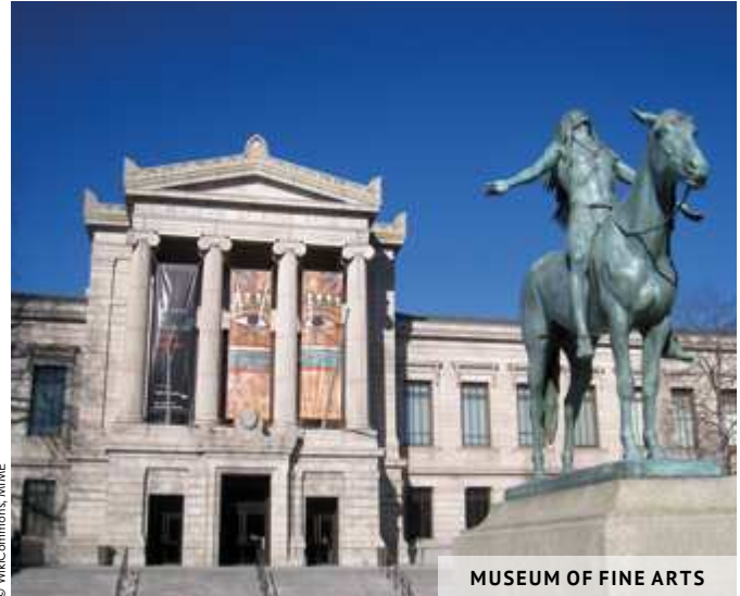
MUSEUM OF FINE ARTS

Designated as a National Historic Landmark in 1986, the Boston Public Library is the pride of Boston. Established in 1848, it was the first large free municipal library in the country , the first public library to lend books , and the first to have a children’s section . Over the course of its history, the library was forced to change quarters several times, as its collection continued to grow. Today the Boston Public Library holds more than 23 million items in its various branches across