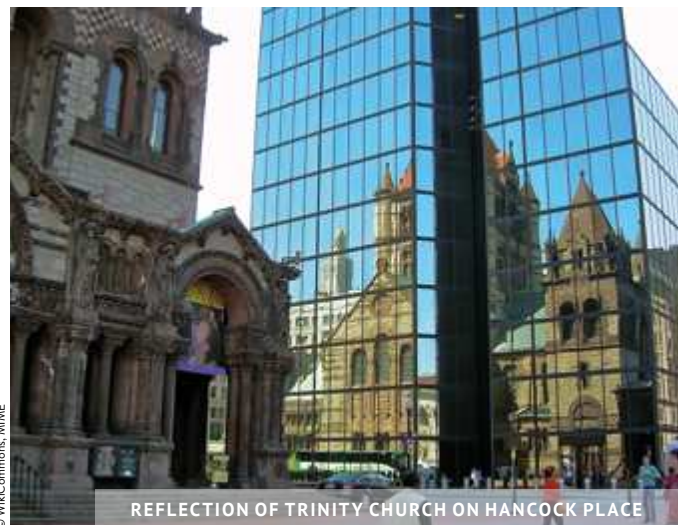
REFLECTION OF TRINITY CHURCH ON HANCOCK PLACE