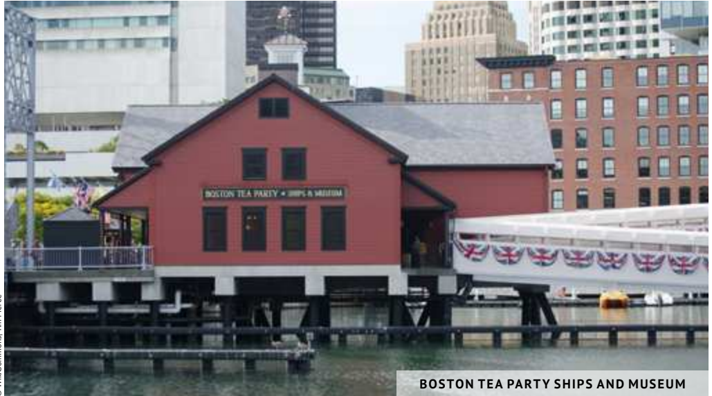
BOSTON TEA PARTY SHIPS AND MUSEUM

This 4-kilometre red-lined route will lead you to 16 official historic sites, including churches, cemeteries, museums, parks and houses, that played a significant role in the American Revolution. The complete circuit takes about a day. If you don't have time to see it all, here are some of the highlights you won't want to miss: