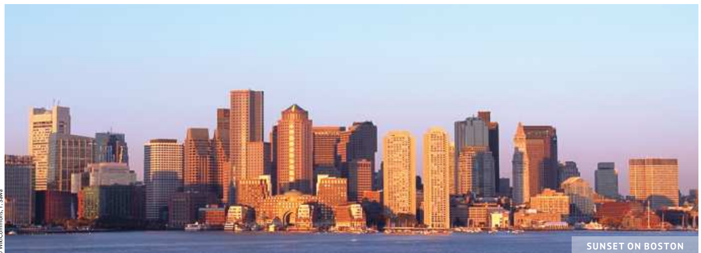
SUNSET ON BOSTON