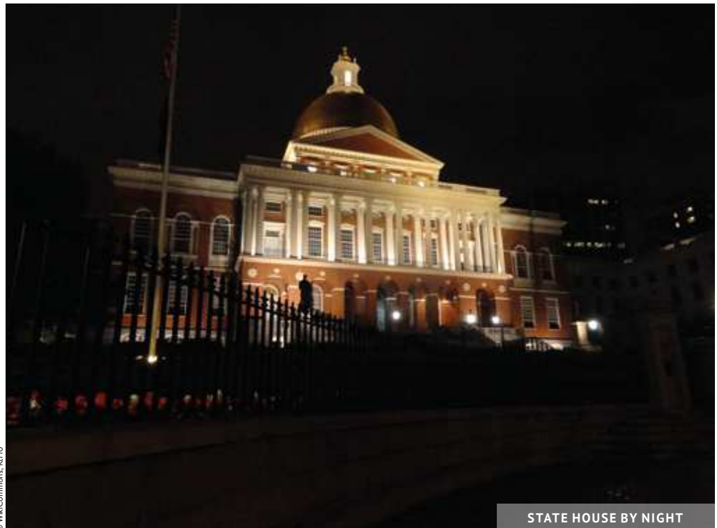
STATE HOUSE BY NIGHT

East of Boston Public Garden ★★ along the Charles River is Back Bay, a neighbourhood most famous for its rows of Victorian brownstone homes but also a popular shopping and dining destination. It's hard to believe that the area used to be covered