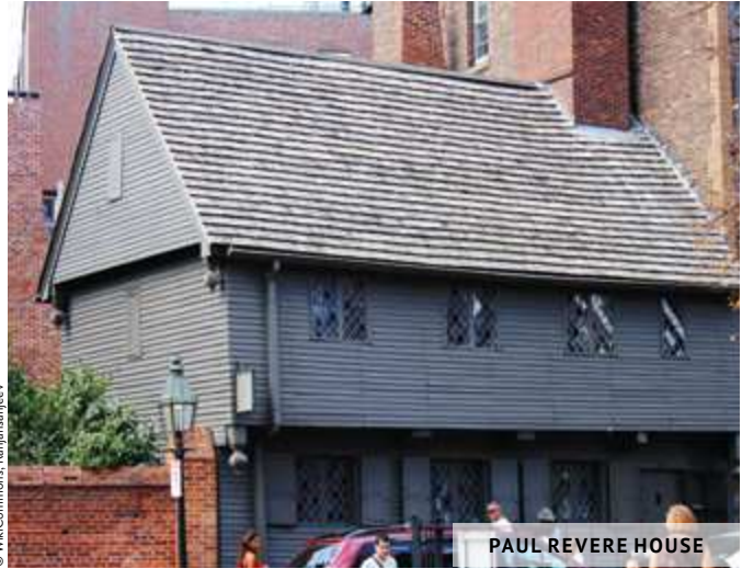
PAUL REVERE HOUSE

Beacon Hill is one of Boston’s most picturesque neighbourhoods , with its English-style red brick houses, gas lanterns and cobblestone streets. A walk through Beacon Hill is a must-do Boston activity, especially at night when the gas lanterns flicker to life, creating a romantic atmosphere! The neighbourhood is named for