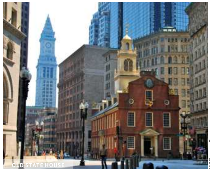
OLD STATE HOUSE