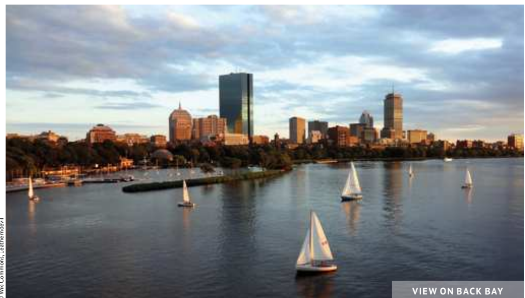
VIEW ON BACK BAY