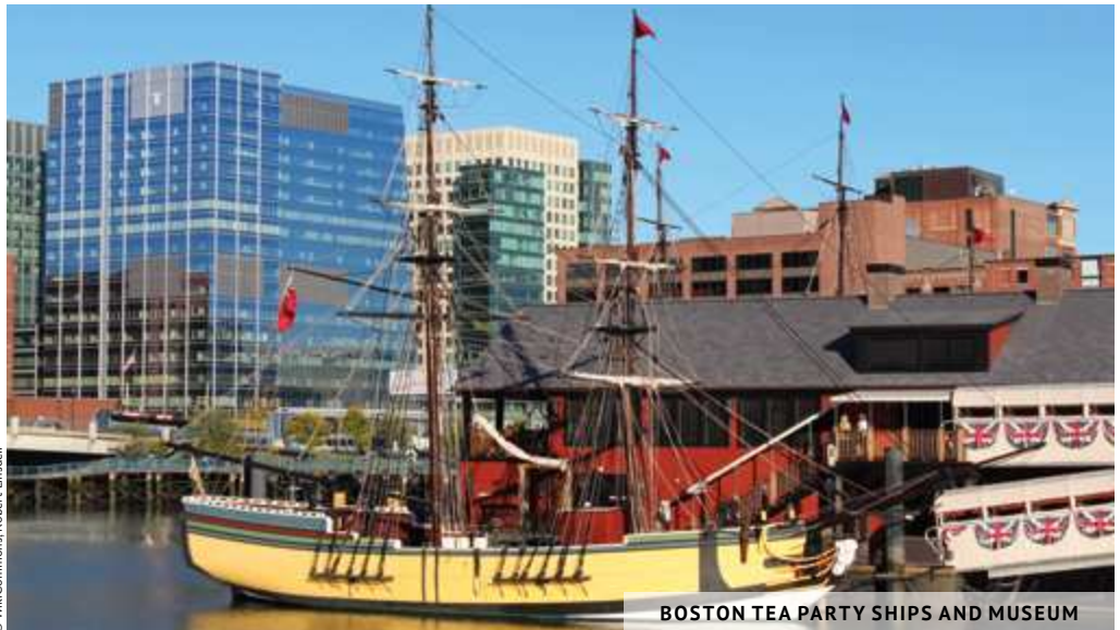
BOSTON TEA PARTY SHIPS AND MUSEUM