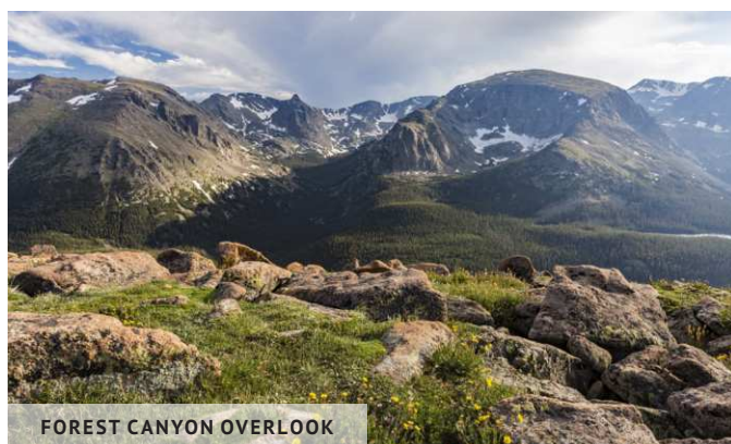
FOREST CANYON OVERLOOK

Magnificent view of Moraine Park and Horseshoe Park meadows, two glacial valleys nestled at the foot of impressive mountains.