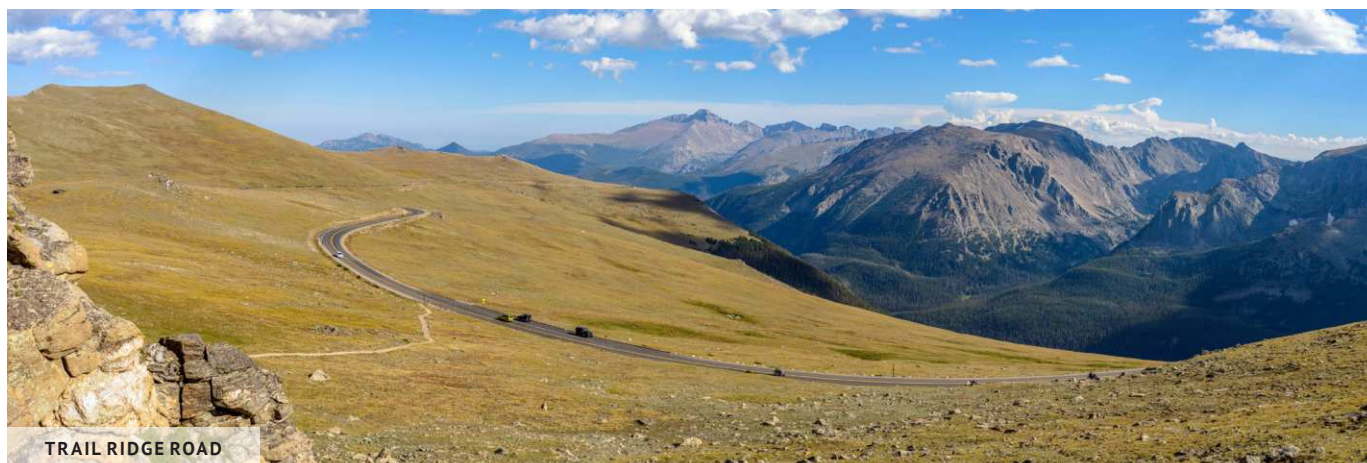
TRAIL RIDGE ROAD