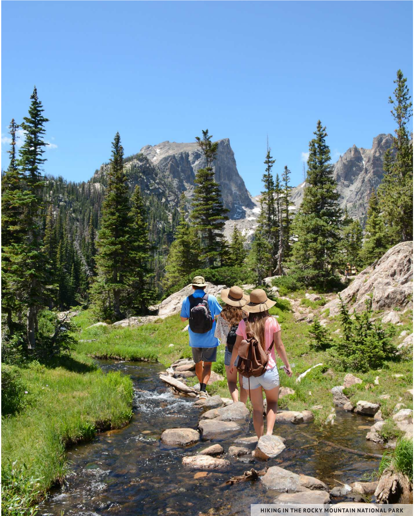
HIKING IN THE ROCKY MOUNTAIN NATIONAL PARK