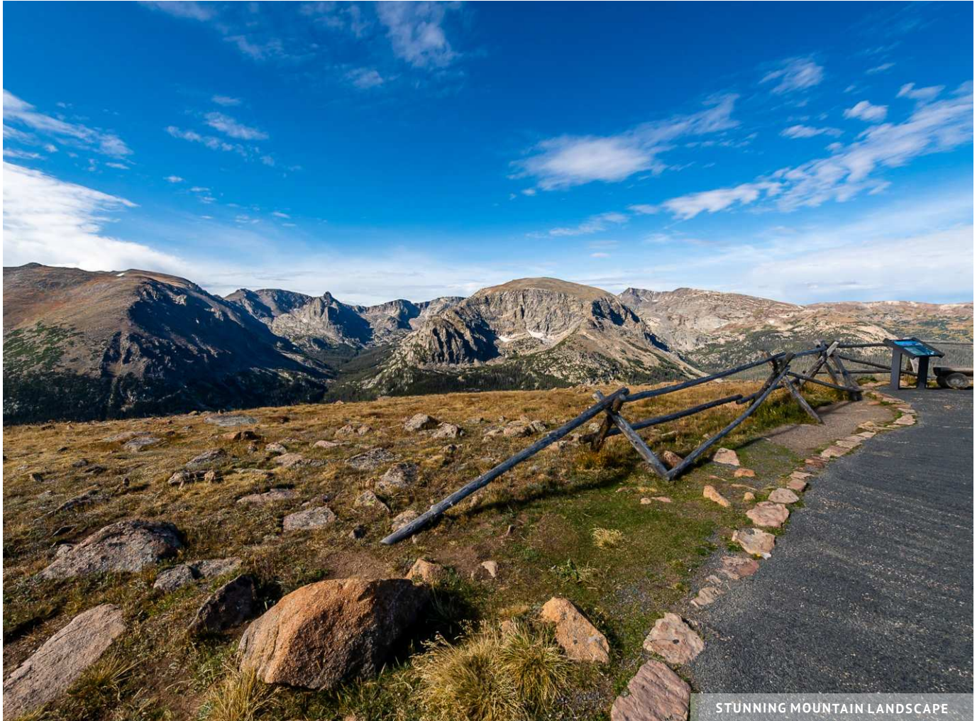
STUNNING MOUNTAIN LANDSCAPE