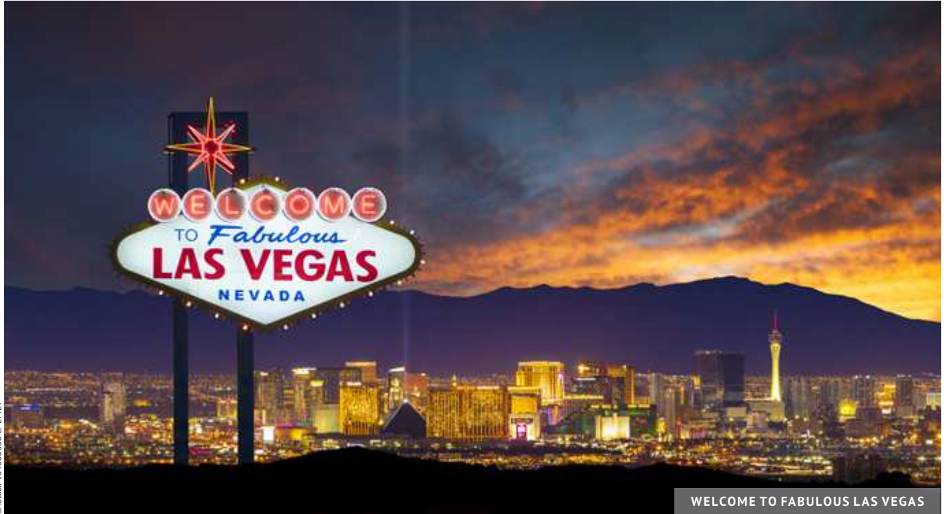
WELCOME TO FABULOUS LAS VEGAS