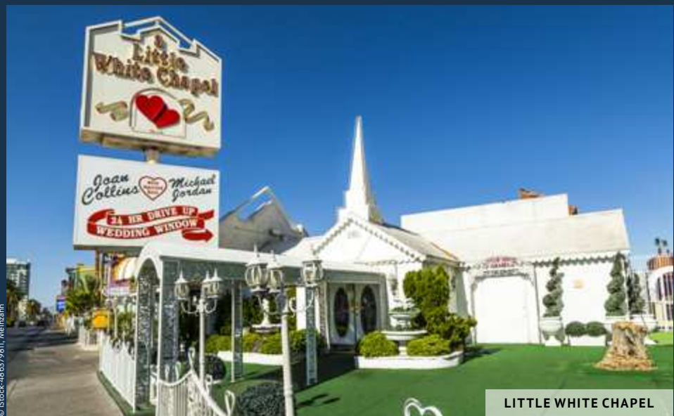
LITTLE WHITE CHAPEL

A Little White Wedding Chapel 1301, Las Vegas blvd. South, Las Vegas / 702-382-5943 www.alittlewhitechapel.com