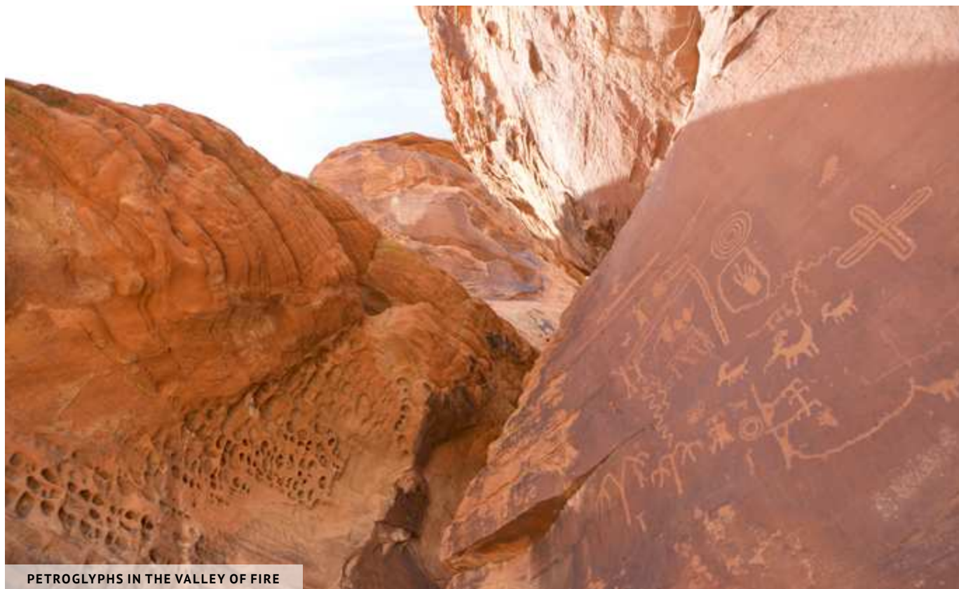
PETROGLYPHS IN THE VALLEY OF FIRE