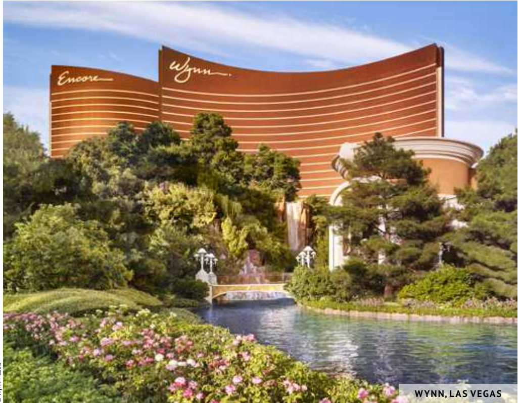
WYNN, LAS VEGAS

3600, LAS VEGAS BLVD. SOUTH 702-693-7111 BELLAGIO.MGMRESORTS.COM