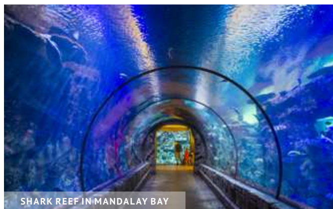
SHARK REEF IN MANDALAY BAY