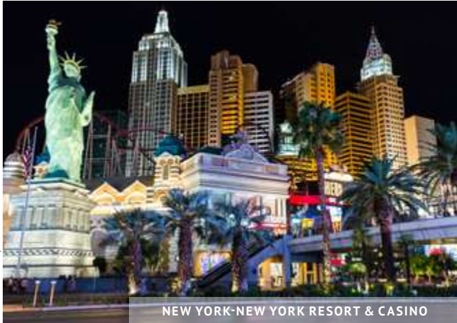
NEW YORK-NEW YORK RESORT &amp; CASINO