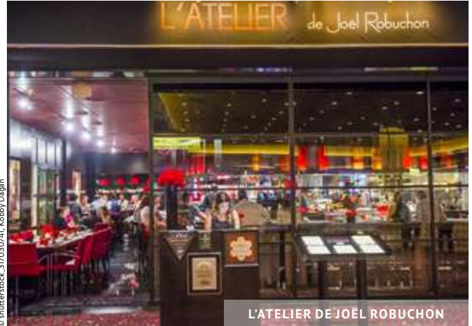
L'ATELIER DE JOËL ROBUCHON