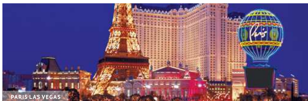
PARIS LAS VEGAS