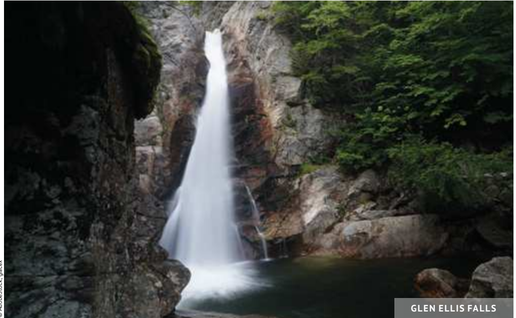
GLEN ELLIS FALLS

Open from late May to mid-October (260 Tramway Drive, Franconia / 603-823-8800 / www.cannonmt.com/things-to-do/attractions/tram ).