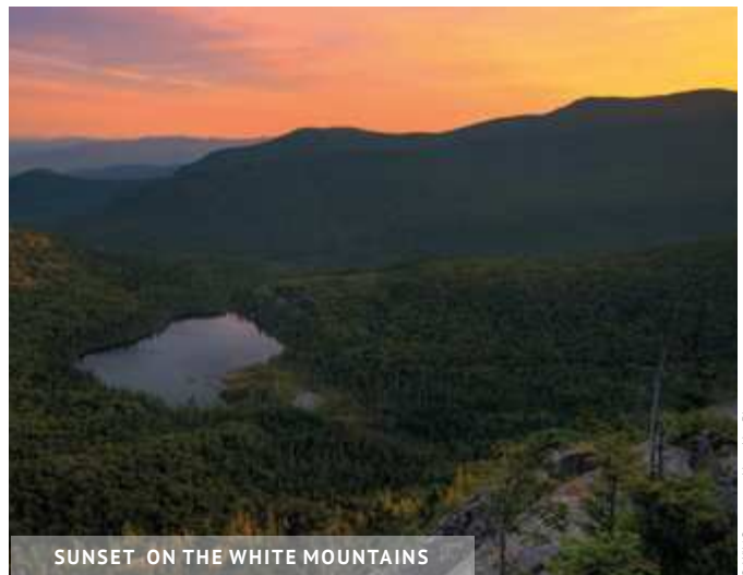
SUNSET ON THE WHITE MOUNTAINS