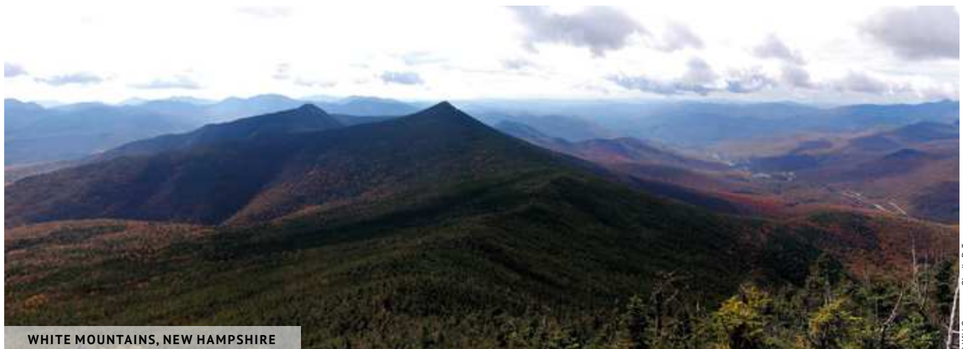
WHITE MOUNTAINS, NEW HAMPSHIRE