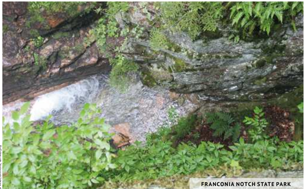
FRANCONIA NOTCH STATE PARK