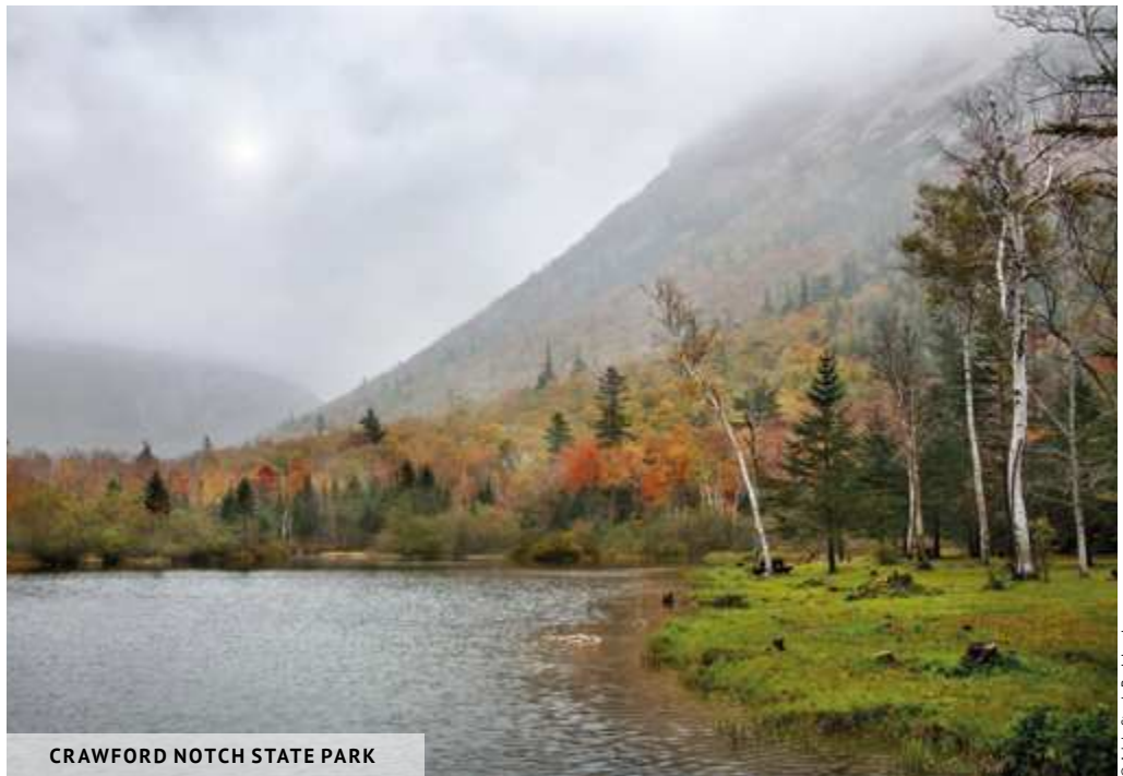
CRAWFORD NOTCH STATE PARK

This nature attraction offers visitors the opportunity to explore 9 granite caves and go rock climbing on its Glacial Wall. The park also offers educational experiences that open eyes to the wonders of the region's unique geology and its animal inhabitants. (705 Rumney (Highway 25), Rumney / 603-536-1888 / www.polarcaves.com ).