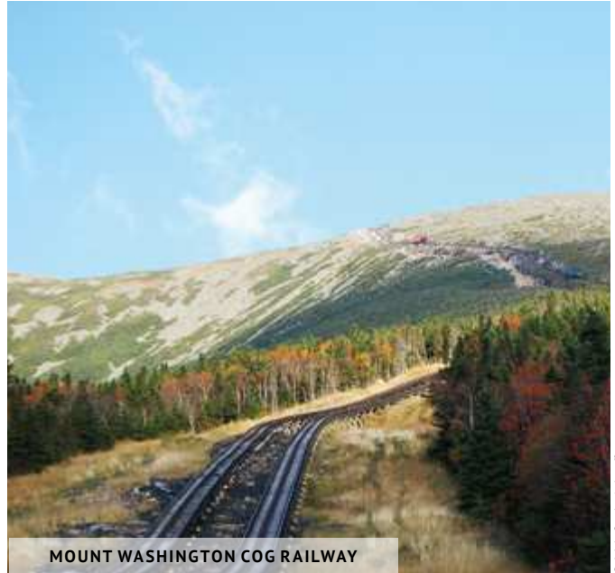
MOUNT WASHINGTON COG RAILWAY

310 MOUNT WASHINGTON ROAD, BRETTON WOODS 800-258-0330 WWW.OMNIHOTELS.COM/HOTELS/ BRETTON-WOODS-MOUNT- WASHINGTON