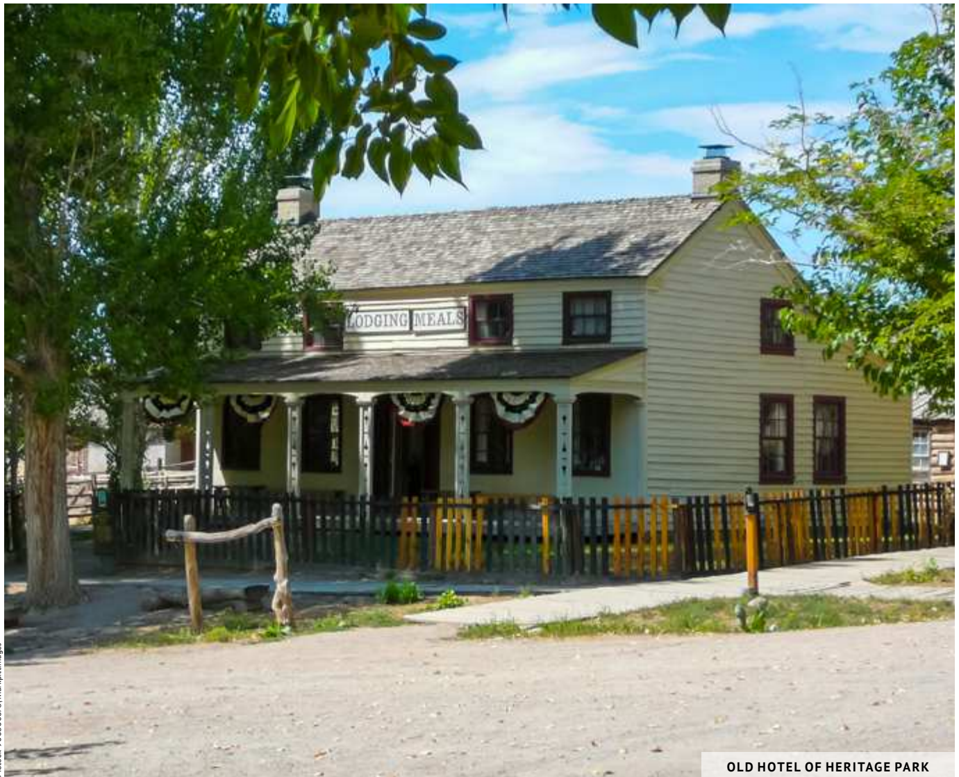
OLD HOTEL OF HERITAGE PARK