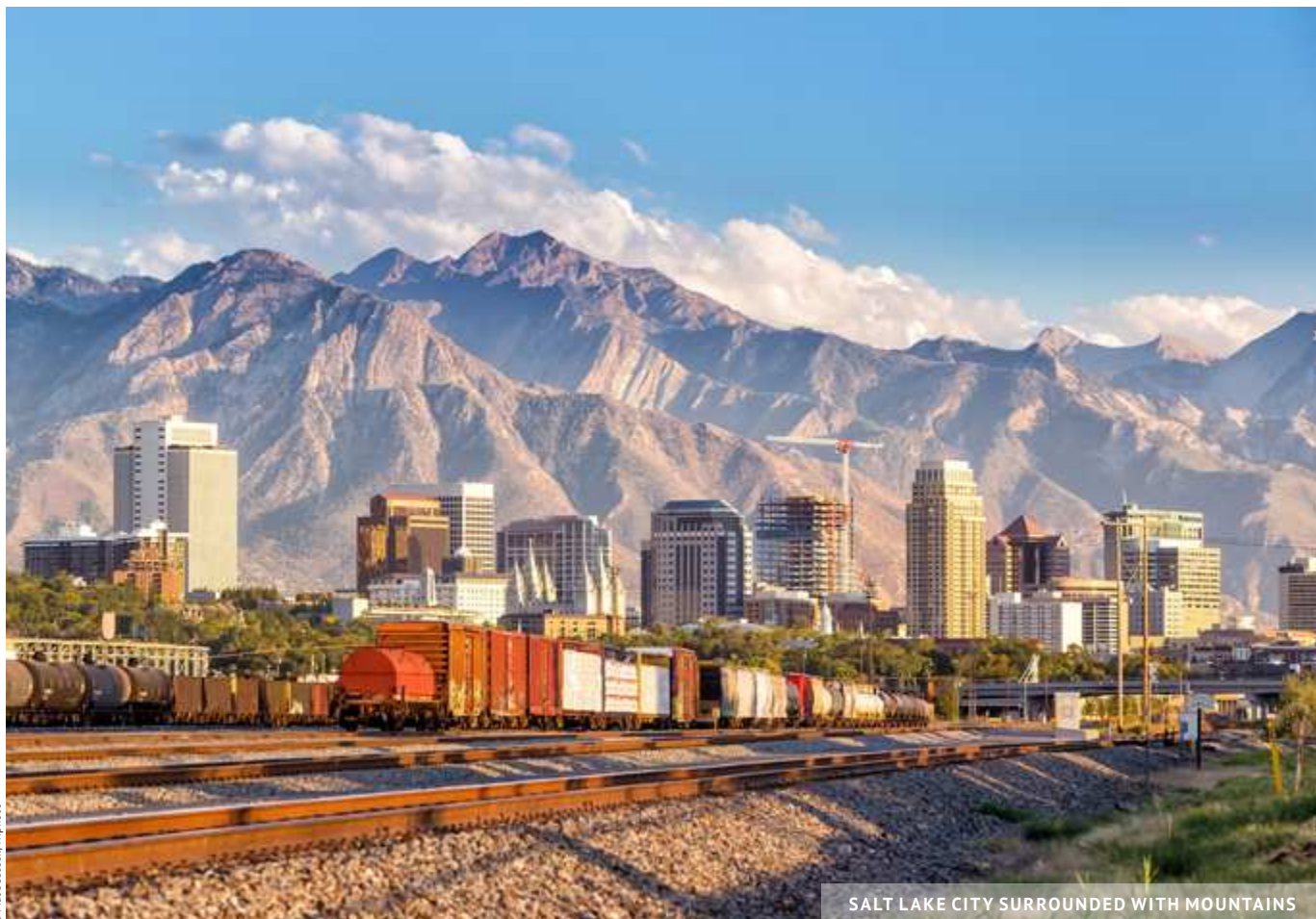
SALT LAKE CITY SURROUNDED WITH MOUNTAINS