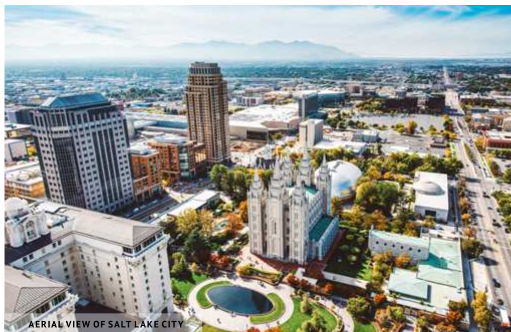
AERIAL VIEW OF SALT LAKE CITY

York to the "Mormon Exodus" to the West. Admission is free! 50, WEST NORTH TEMPLE STREET SALT LAKE CITY 801-240-3310 HISTORY.CHURCHOFJESUSCHRIST.ORG/LANDING/MUSEUM