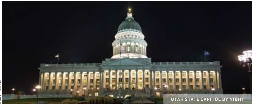
UTAH STATE CAPITOL BY NIGHT