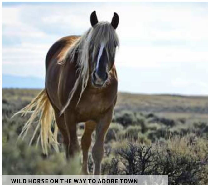
WILD HORSE ON THE WAY TO ADOBE TOWN

The area is home to herds of wild horses and pronghorn antelope. Have your camera at the ready!