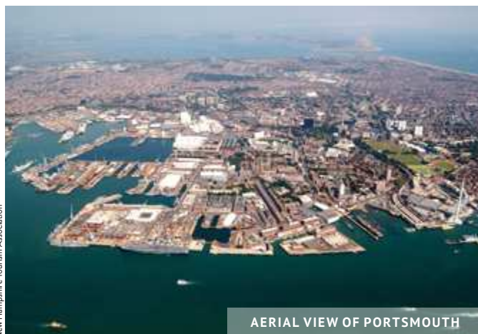
AERIAL VIEW OF PORTSMOUTH