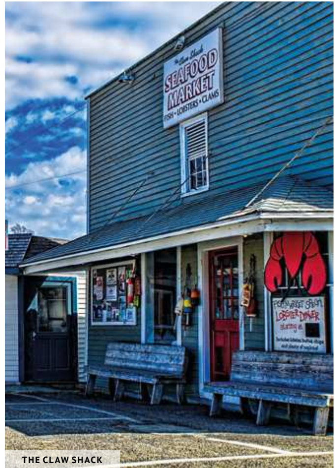
THE CLAW SHACK

This restaurant is a must in Kennebunkport for a good gourmet meal. The menu is inspired by the seasons and uses the freshest local ingredients. The décor is also beautiful both inside and out and the food is delicious: hand-made pasta, house-made charcuteries, wood-fired pizza, seafood and organic vegetables. 354, GOOSE ROCKS ROAD, KENNEBUNKPORT 207-967-6550 WWW.EARTHATHIDDENPOND.COM