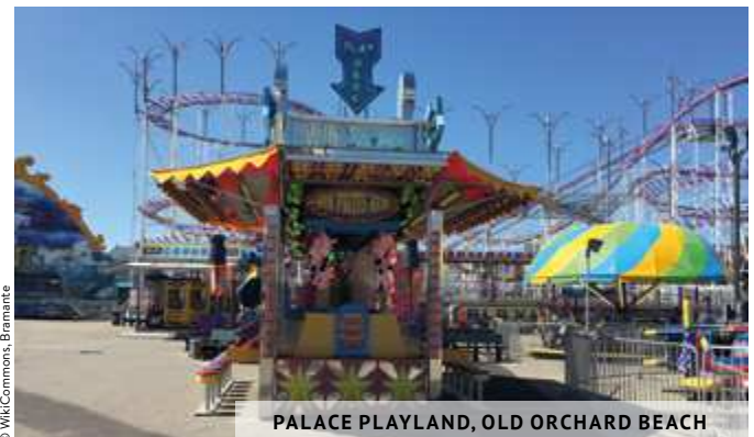
PALACE PLAYLAND, OLD ORCHARD BEACH