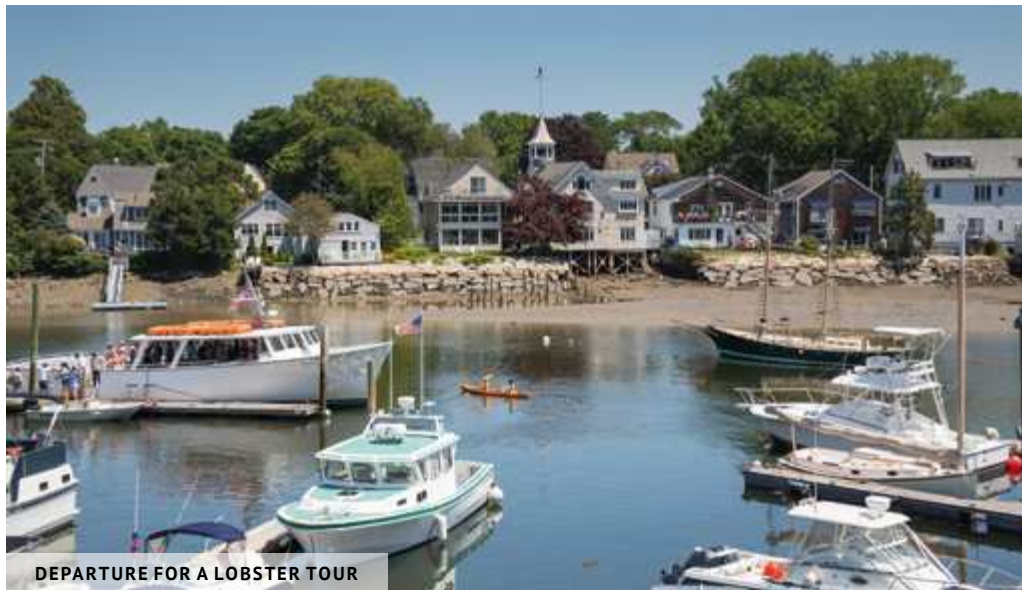
DEPARTURE FOR A LOBSTER TOUR

95, OCEAN AVENUE, KENNEBUNKPORT 207-468-4095 WWW.RUGOSALOBSTERTOURS.COM