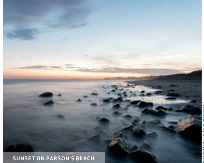
SUNSET ON PARSON'S BEACH

To enjoy the beach with maximum convenience, arrive early! Most of the beachfront parking is reserved for seasonal visitors and spaces are often limited. By arriving early at Colony Beach ★, you can take advantage of free parking and be within walking distance of regional attractions and great restaurants. The same goes for Parson's Beach ★★, where there are only 25 parking spaces.