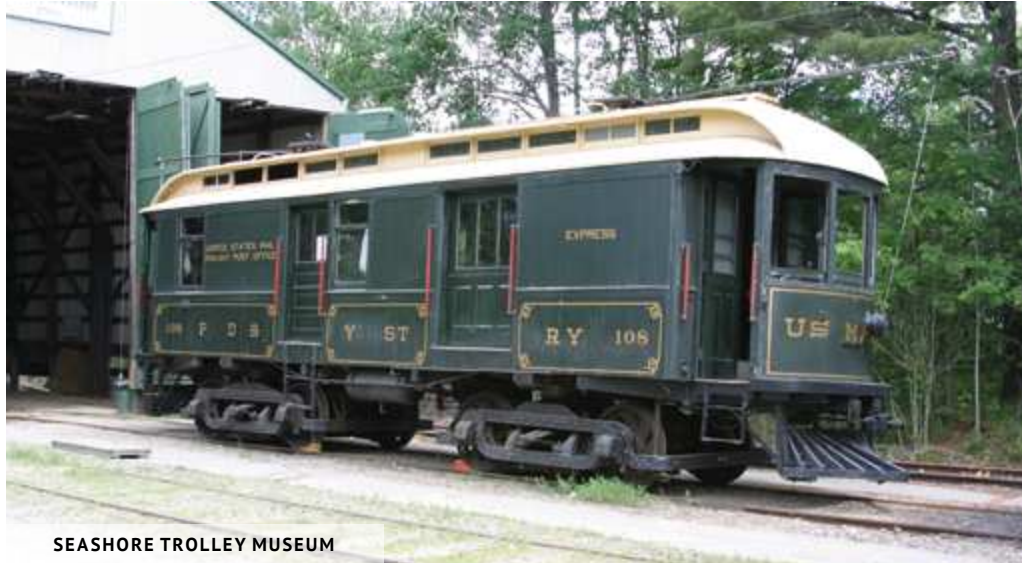
SEASHORE TROLLEY MUSEUM

195, LOG CABIN ROAD, KENNEBUNKPORT 207-967-2800 WWW.TROLLEYMUSEUM.ORG