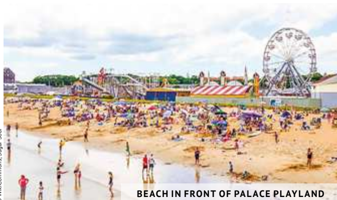
BEACH IN FRONT OF PALACE PLAYLAND