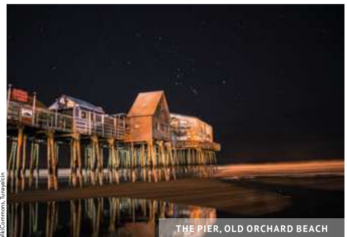
THE PIER, OLD ORCHARD BEACH