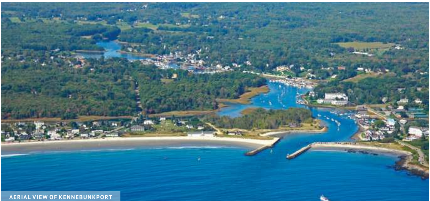
AERIAL VIEW OF KENNEBUNKPORT