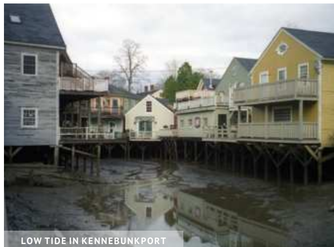
LOW TIDE IN KENNEBUNKPORT