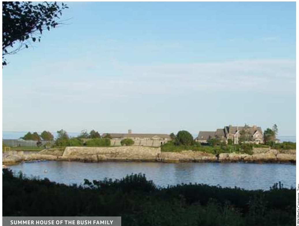
SUMMER HOUSE OF THE BUSH FAMILY