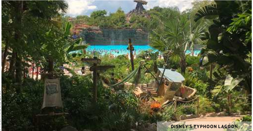
DISNEY'S TYPHOON LAGOON