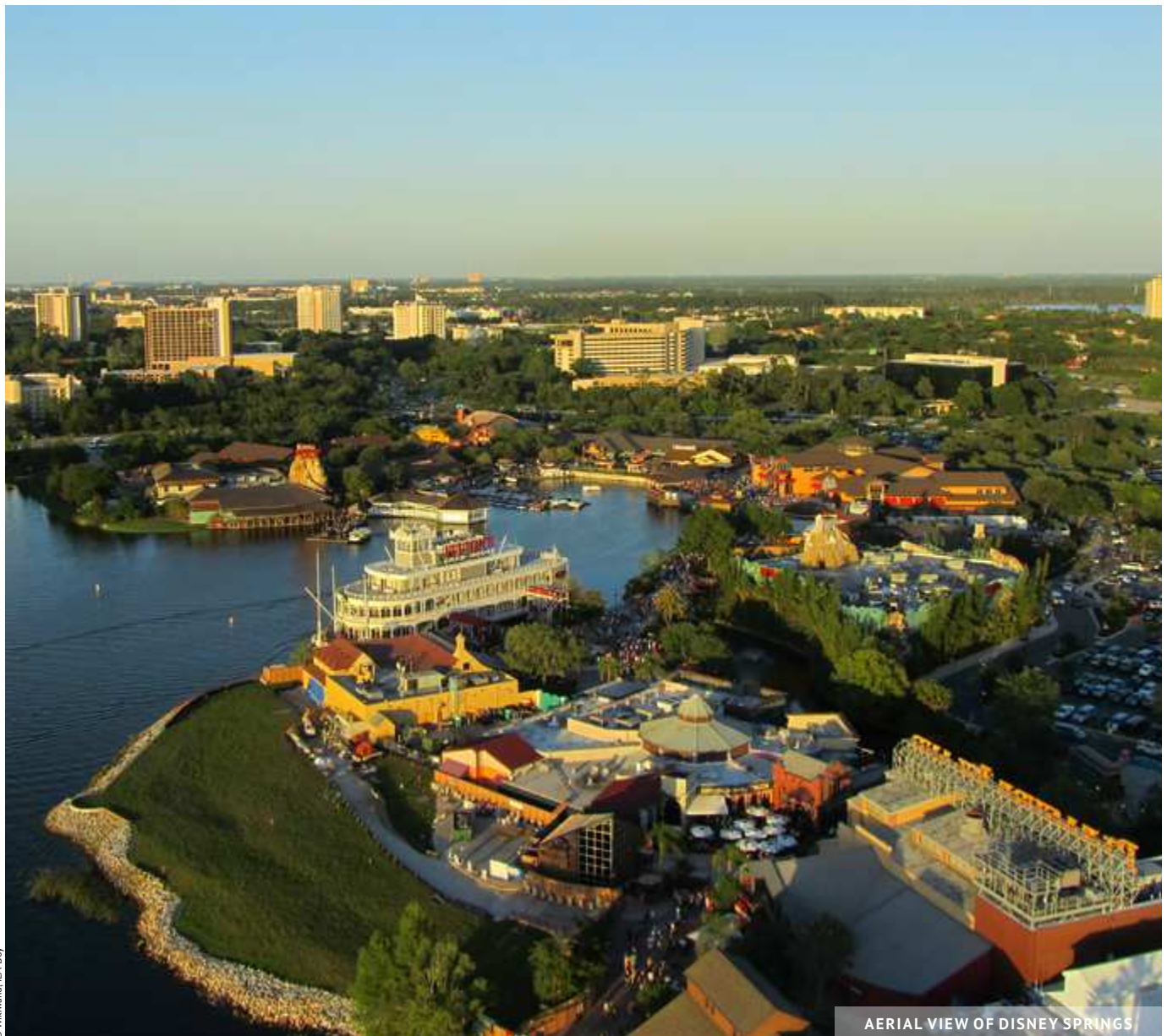
AERIAL VIEW OF DISNEY SPRINGS