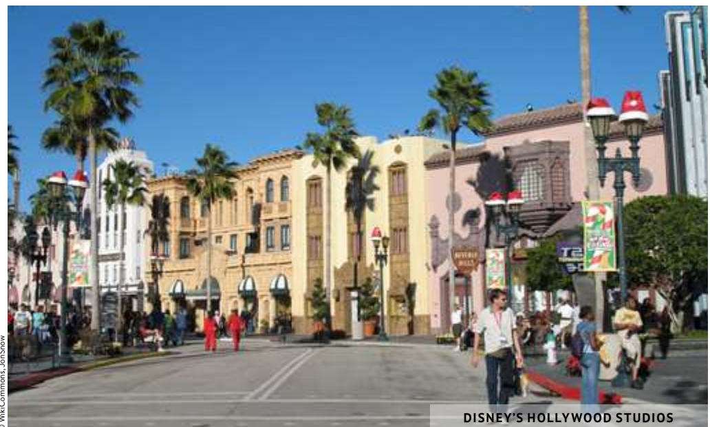
DISNEY'S HOLLYWOOD STUDIOS