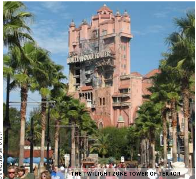
THE TWILIGHT ZONE TOWER OF TERROR