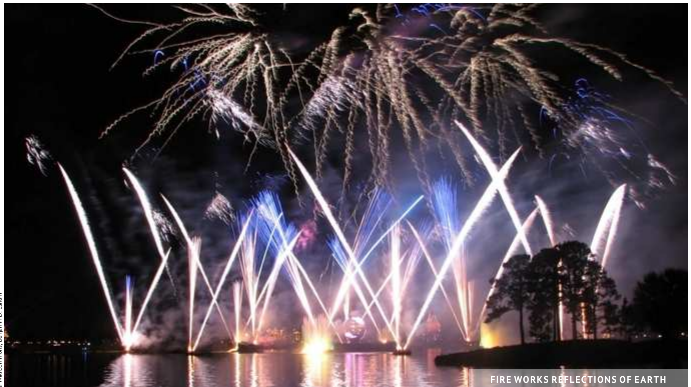
FIREWORKS REFLECTIONS OF EARTH

Universal's City Walk : This popular restaurant chain, inspired by the film Forrest Gump, serves shrimp and seafood prepared in a variety of ways in addition to fish, meat, sandwiches, soups and salads.