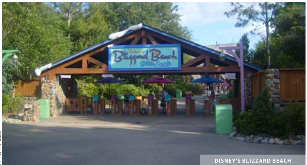
DISNEY'S BLIZZARD BEACH